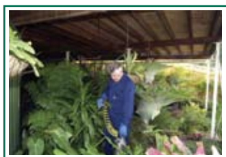
Shaded, dark, humid areas where mosquitoes congregate